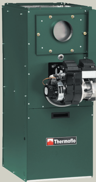
Up flow or Counter flow

70,000 to 112,000 Btuh Input 0.50 to 0.80 GPH #2 Fuel Oil